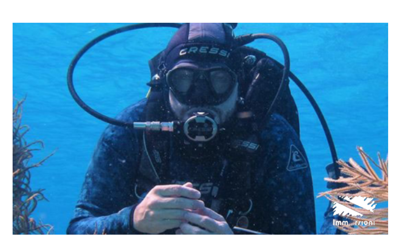
Padi Open Water Diver Manual Pdf Torrent