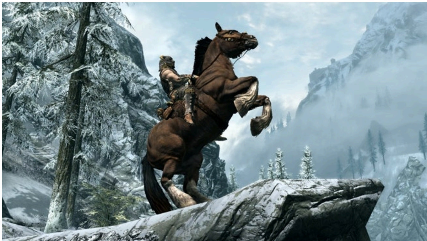
Skyrim End Of The World Modl