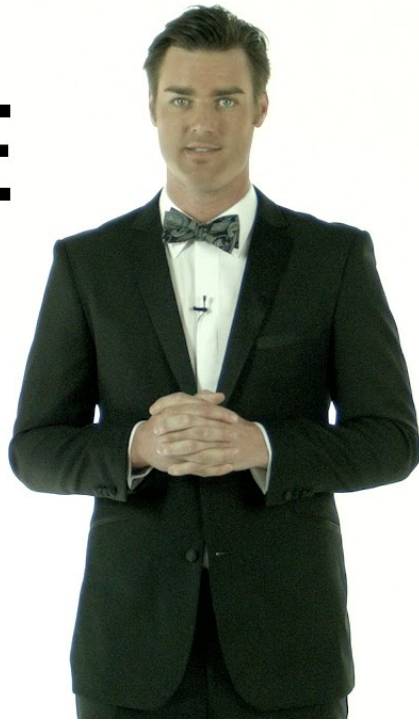
Black Tie Formal Wear